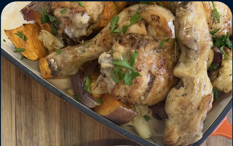
Plate the roasted chicken and vegetables, garnishing and serve!